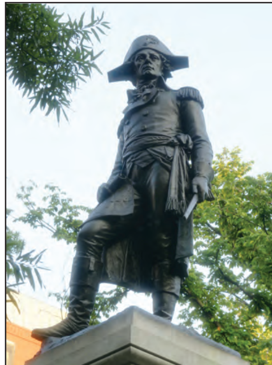
Statue of General Kosciuszko in Lafayette Park in front of the White House.